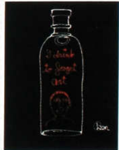
ABSOLUT BEN by Ben, 1999