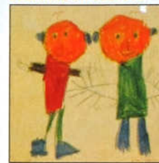
Mother and Father November 14, 1969