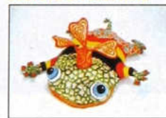
The Royal Frog in Love January 20, 2000